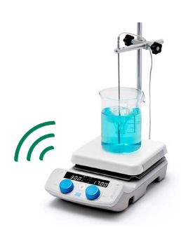
AREC Connect System with Probe, Rod and Clamp